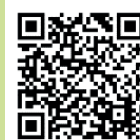
YouTube Staplehurst Parish Council