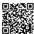
Parish Council Website

Both at the Community Centre South Hall at 7.30pm