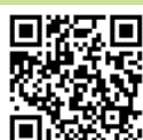
Facebook Staplehurst Parish Council