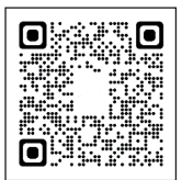
Report a Pothole

There are still projects being worked on, such as the school area and road signage, etc. at the new developments, but we chip away at it – a bit like water torture but we get there eventually! We continue to monitor road surfaces and would encourage any resident to report directly to KCC on their website, "Report a problem on a road or pavement" area. Some of us have taken to carrying a ruler with us when taking a picture to show depth and scale as proof it needs repairing! Please do join the Speedwatch team. As the weather improves it's a lovely chance to stand in the sunshine and slow down speeding drivers.