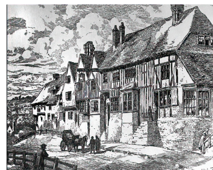
Bell Inn Etching 1871

The archivists would love to see any photographs you might have of Staplehurst, people, places and events from 1920 to 1970 to add to their photographic archive. They would also like to hear from people who have memories of the various events, clubs and organisations within the parish.