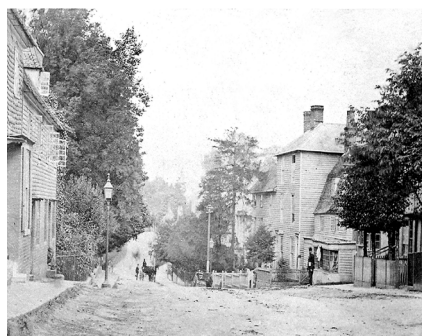
Staplehurst High Street 1877

It is to the history of Staplehurst, both people and places, where members of the society now channel their energies. The Society's archivists care for nearly 4,000 photographs, maps, deeds, work ledgers, posters, artefacts and biographies relating to Staplehurst. The archives are held at the Village Community Centre, 1st floor and are available to view by appointment on Monday mornings 10am – 12noon.