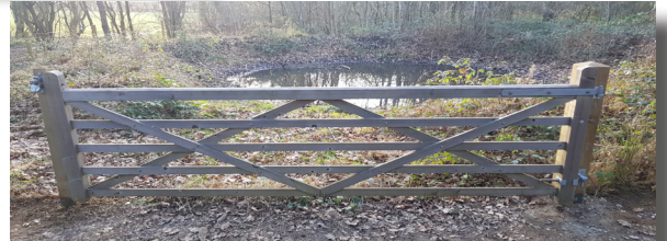
Top right & below : New gates at Wimpey Field