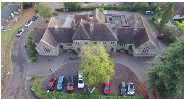
Aerial view of the Village Centre.

Just as we were getting used to fewer Covid restrictions, Omicron plunged us into Plan B. However, we are now emerging from that, and thanks to the resilience of our users, the halls are filling up with interesting events again. The one-off Comedy night in December proved to be such a success that there is another one planned for the spring. Watch our Facebook page for details. For card game lovers the Bridge Club has taken up temporary residence in the West Hall on Friday evenings. Why not try it out? And the Farmer's Market takes place again monthly from February. This is on top of the usual array of regular events, clubs, parties and sessions. We're open to all