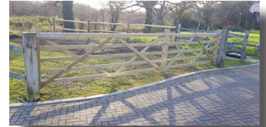
Top Left: Bell Lane Car Park