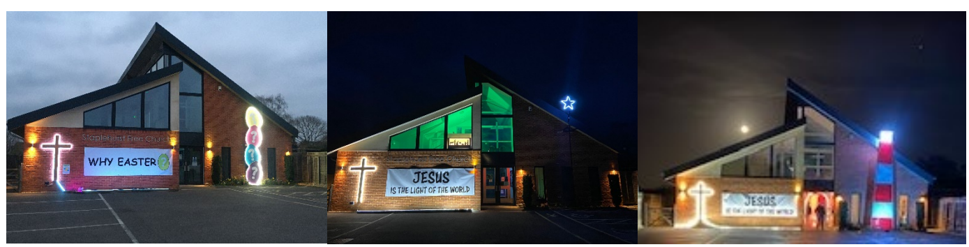
Within the constraints placed on us by the pandemic, we have endeavoured to provide suitable socially distanced outdoor activities for the community's children .

Throughout the last year the church has endeavoured to support the village community, whilst recognising the work done by the parish council and the Staplehurst Emergency Help Team. Our aim continues to be to communicate Jesus' love through the various means at our disposal, especially during what has been a difficult year for so many.